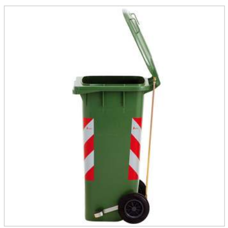
foot pedal version