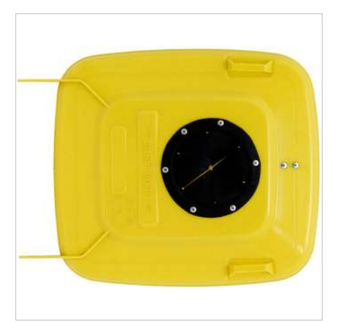
lid for glass/tins - 160 mm