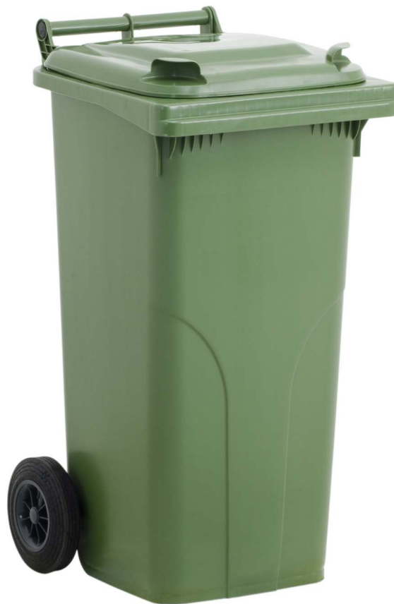
two wheeled bins