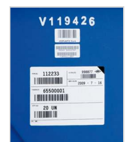
serial numbers customized labels