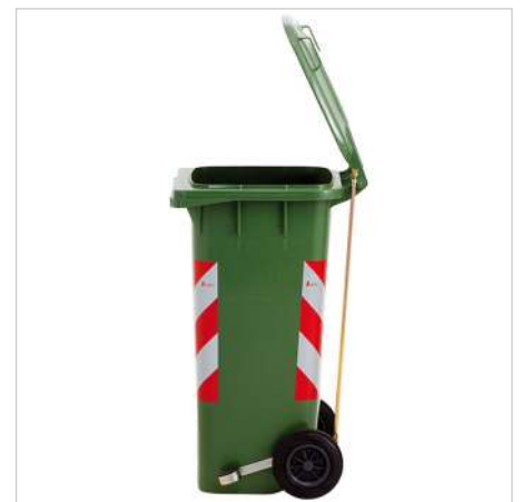
foot pedal version