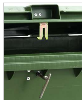
jco lock triangular key