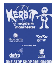
hot foil stamping