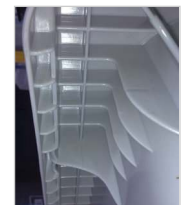
reinforced comb with spring system