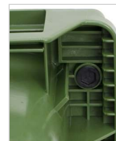
chip nest aperture