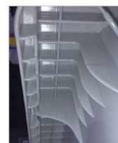
reinforced comb with spring system