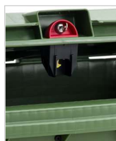
sudhaus gravity lock