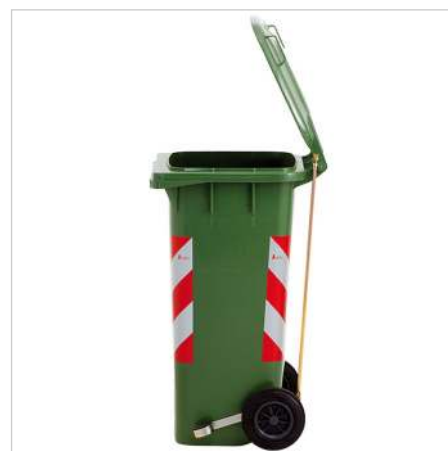
foot pedal version