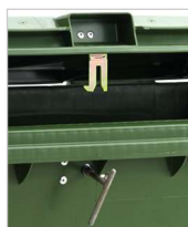
jco lock triangular key