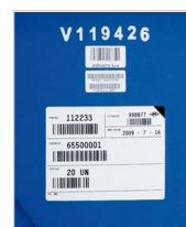
serial numbers customized labels