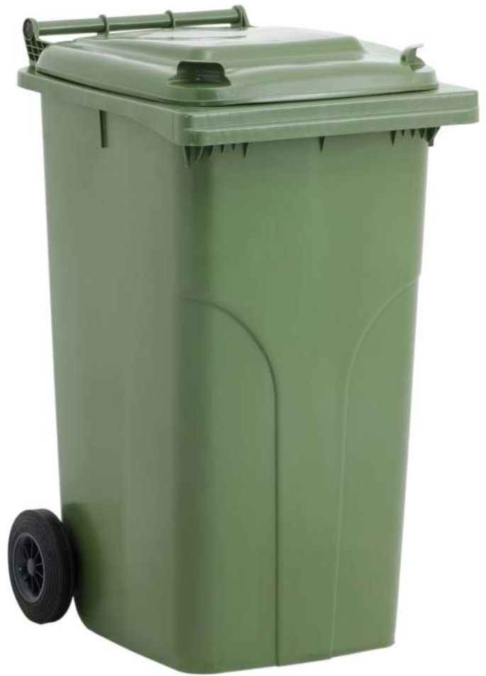
two wheeled bins