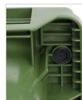
chip nest aperture