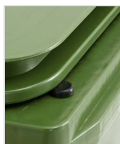
noise reduction application