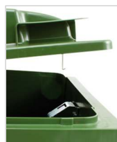
central gravity lock