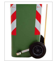
foot pedal lid operation