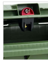
sudhaus gravity lock