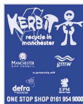
hot foil stamping