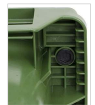
chip nest aperture