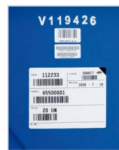
serial numbers customized labels