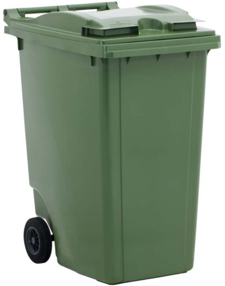
two wheeled bins