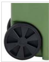
Nose wheel 300 mm