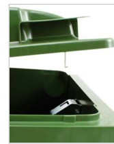
central gravity lock