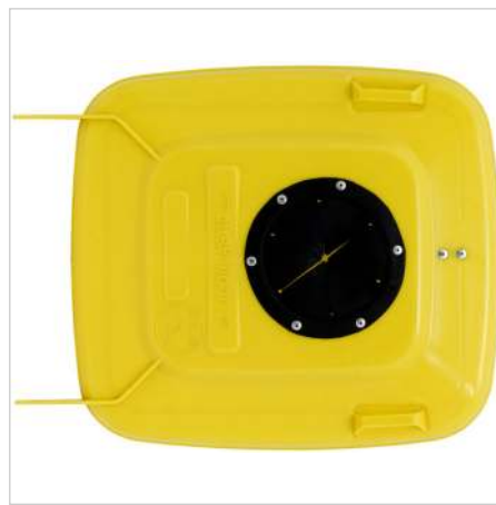
lid for glass/tins