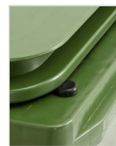
noise reduction application