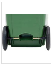
rear kick plate