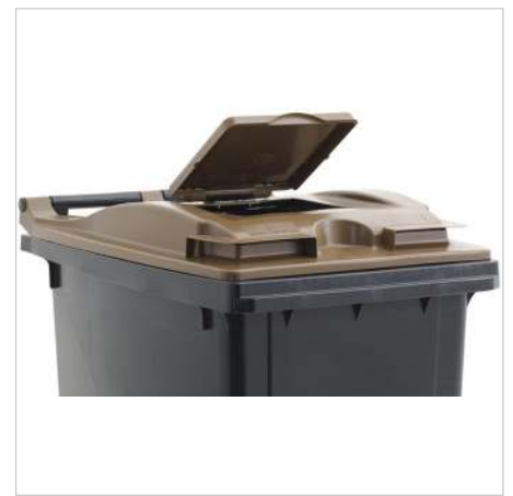
lid on lid version