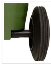
noise reduction application