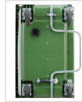
foot pedal provided with shock-absorber