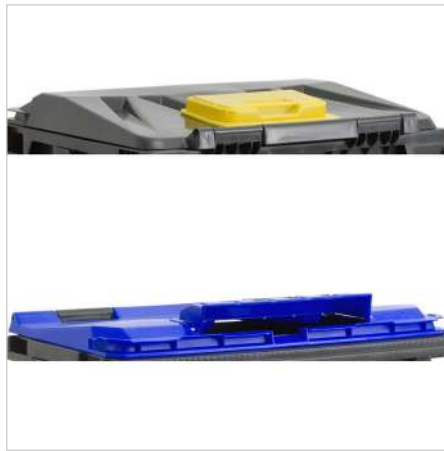
lid for multimaterial/paper