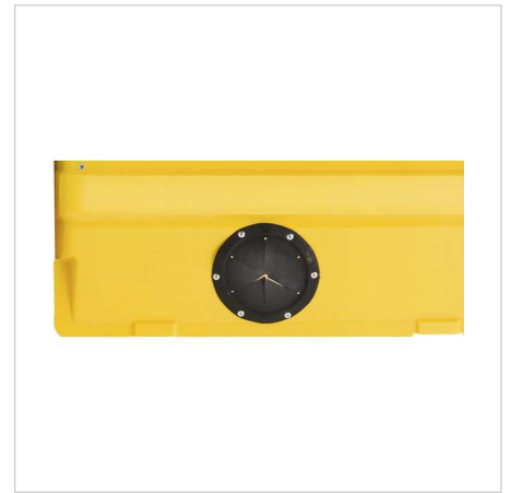
lid for glass/tins (detail)