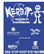
hot foil stamping