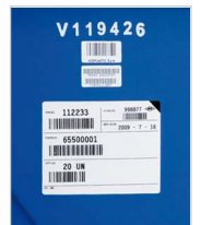
serials / stickers customized labels