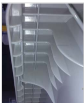
reinforced comb with spring system