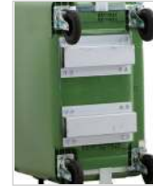
empty by upturning using forks