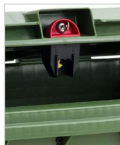
sudhaus gravity lock