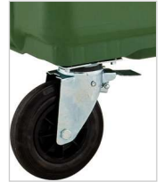
reinforced fastening wheel