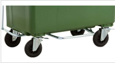
foot pedal for lid opening