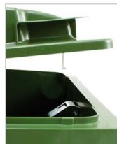
central gravity lock